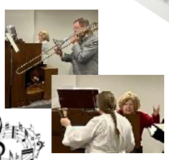
"MUSIC TO MY EARS..."